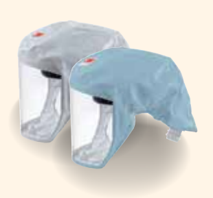
3M™ Versaflo™ Headcover S-133 and S-133B Head and face coverage.

Integrated Comfort suspension. General purpose fabric.