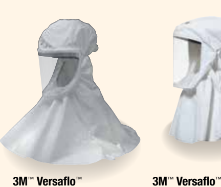
3M™ Versaflo™ Economy Hood S-403 Head, face, neck, and shoulder coverage. Fabric suspension, inner shroud.